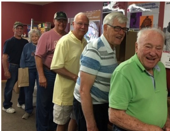
Evansville Lions Club volunteers